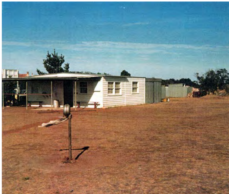
Above: Original Clubhouse and Machinery Shed Extension

Reserve A/c $318.92 Fixed Deposit $959.21 Grand Total $4627.70