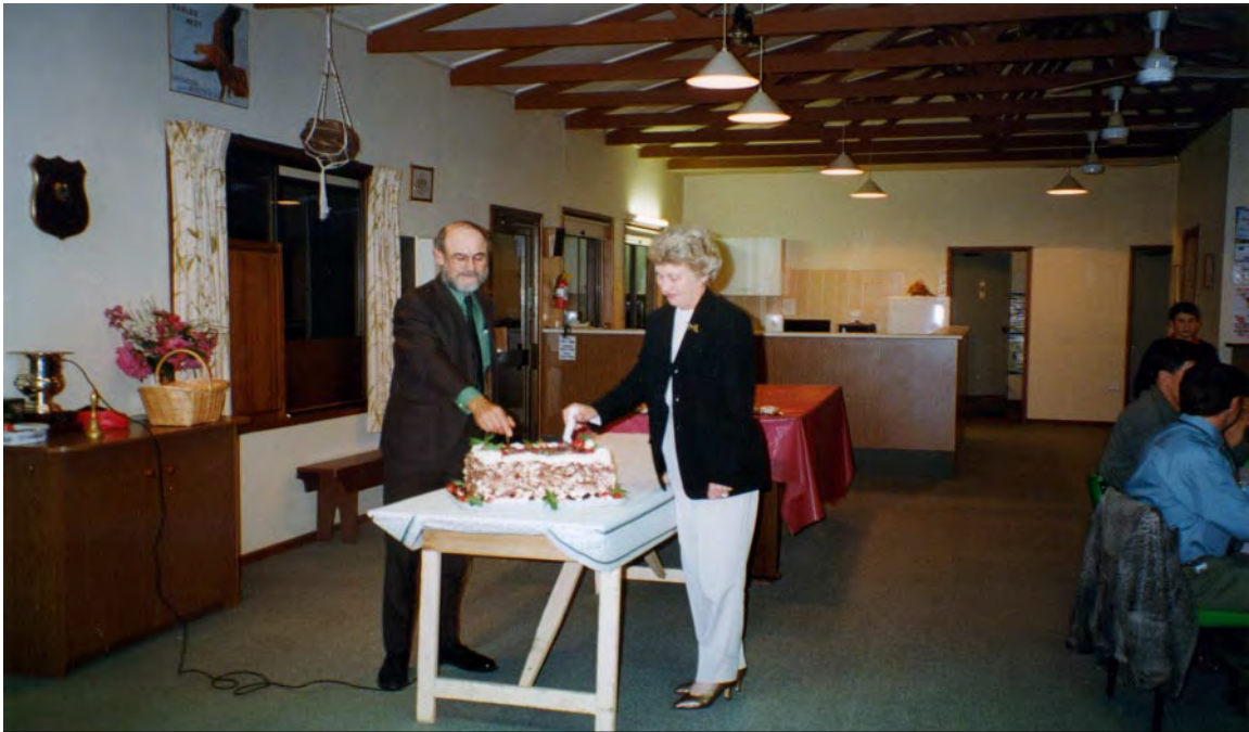
Above: Cutting of the cake at the 25 th Anniversary celebration.