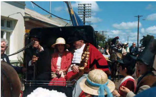
Above: Duchess of Hamilton visiting Hamilton.

The Ladies conducted a Melbourne Cup Luncheon on 6.11.84. This was very successful with approximately $200 profit, 56 ladies attended. L.A. Walker donated a television for use by the ladies during the day.