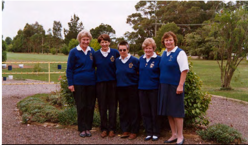
Above: Ladies Division 2 Pennant Team.