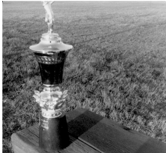
Above: Spittle Trophy

Resulting from the 1987 Annual Meeting, the Club set the 1988 fees at $40 single, $70 double, $10 junior, Green Fees $2 and $1 junior.