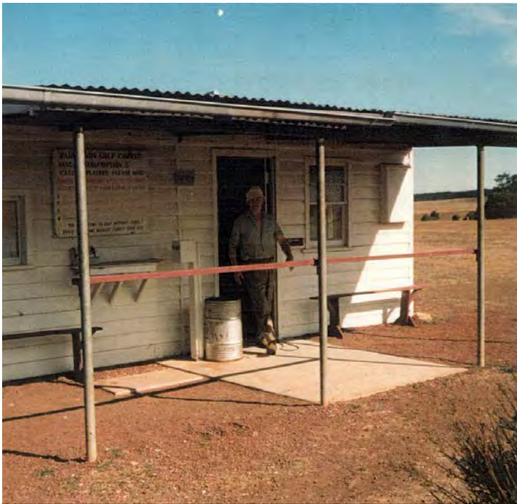
Above: Original Clubhouse