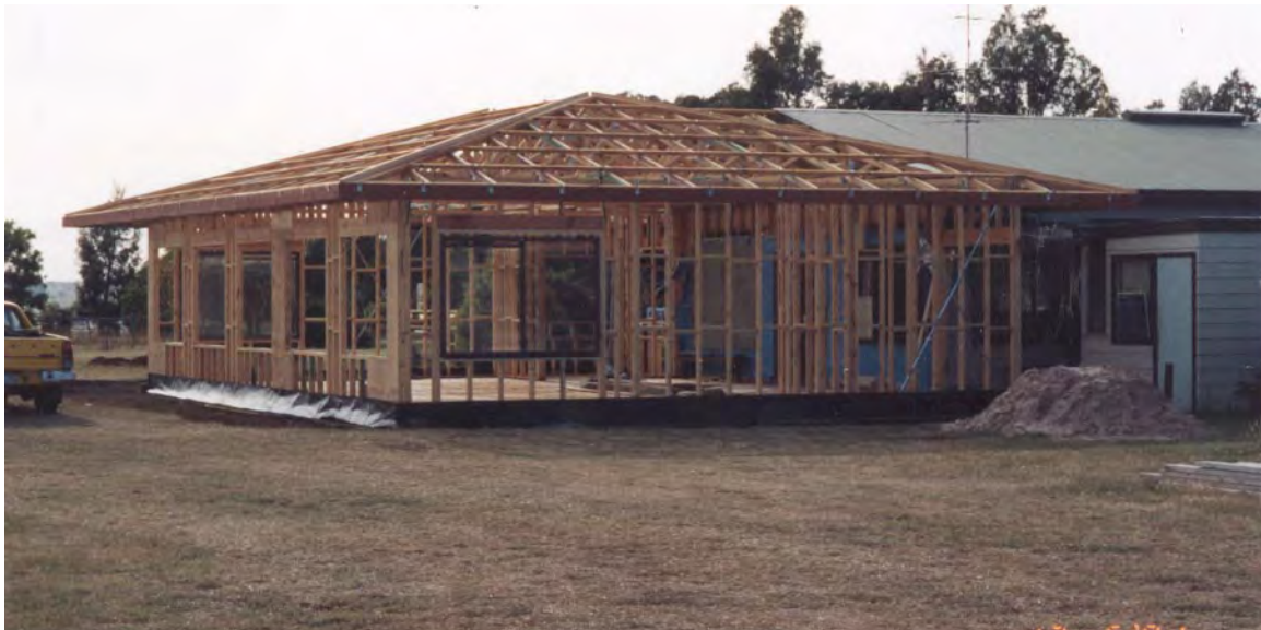
Above: Building of Clubhouse Extensions