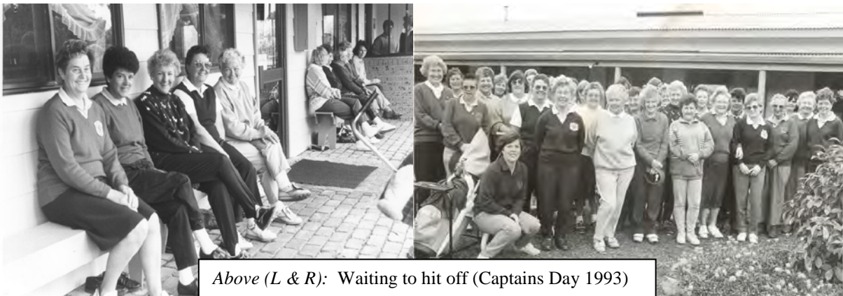
Above (L & R): Waiting to hit off (Captains Day 1993)