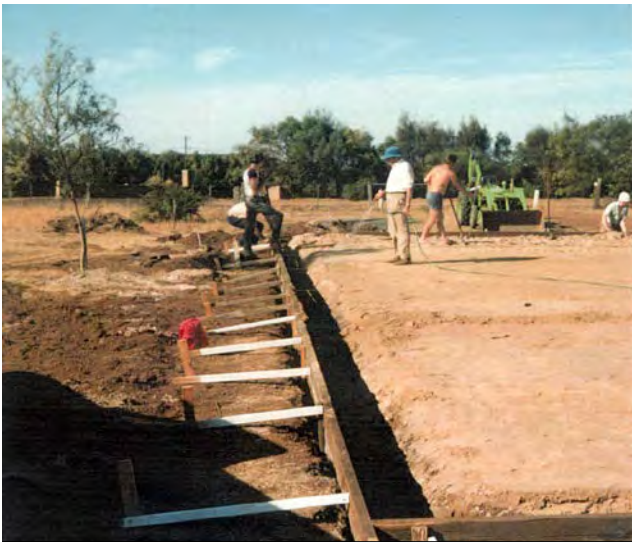
Above & Below: Foundations for new clubhouse

This year saw further consolidation of the Club. 20,000 score cards were organised and obtained.