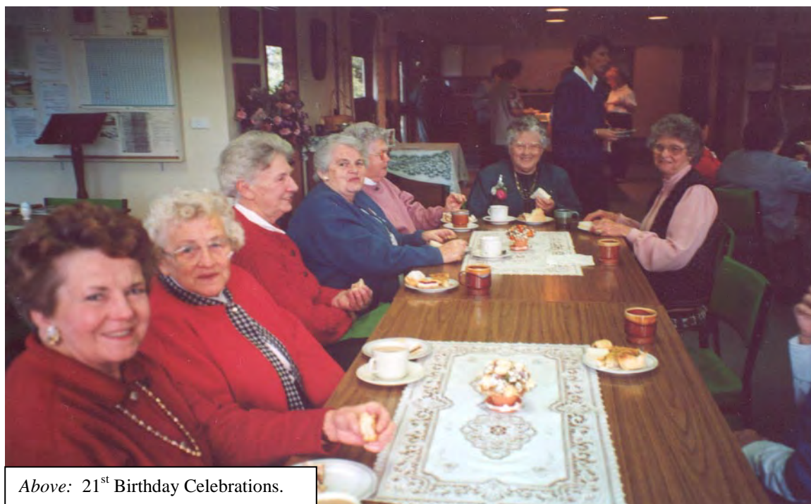
Above: 21 st Birthday Celebrations.

Ladies commence Saturday golf (ref page 49 and photo).