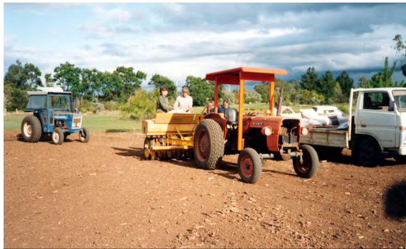
Above: Work on new fairways.

In spite of the setback the Club was experiencing in obtaining the "horse paddock", it pressed on with the construction of the new fairways. Many working bees were organised including an "Emu Parade" involving ladies, children and men whose task was to form a line across the new fairways and proceed to walk along behind other trailers, trucks etc picking up any small sticks etc left behind by the heavy machinery.