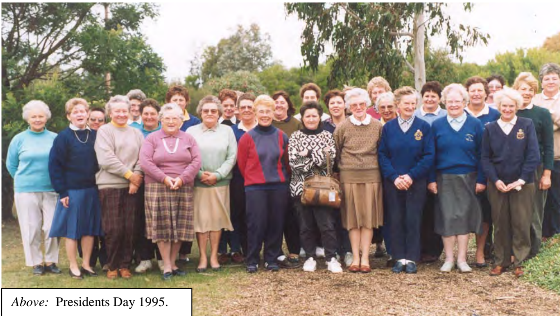
Above: Presidents Day 1995.