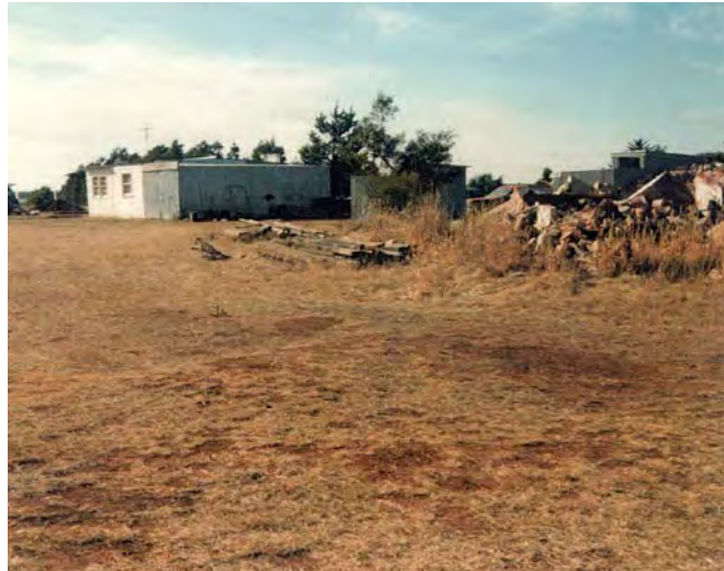
Above: Extension to Original Clubhouse

A decision to extend the existing 3m shed at an approximate cost of $300 was made. Plans were drawn up and negotiated with Hamilton City Council resulting in the extensions being completed on 11.7.81.