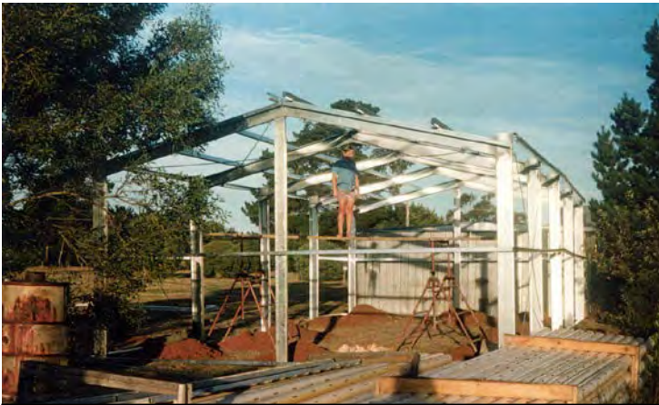
Above: Construction of Machinery Shed.