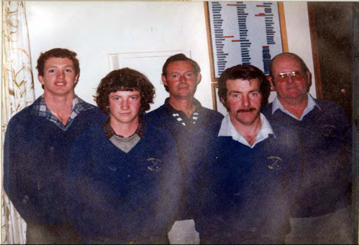
Above: Parklands first successful pennant team.