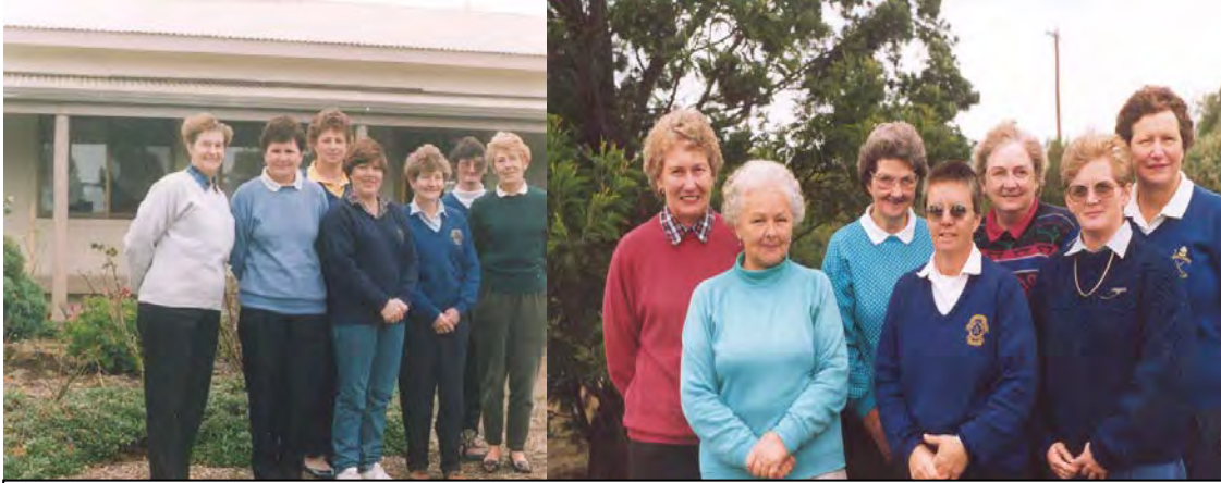
Above (L & R): Ladies Pennant Teams.